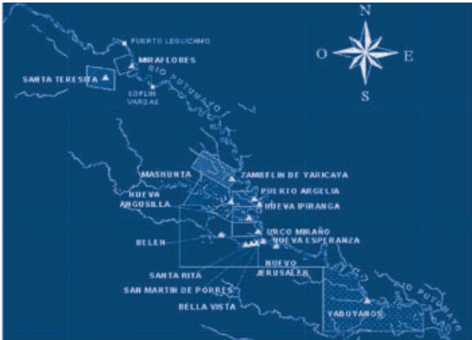
Map 1. The titled native communities in the Teniente Manuel Clavero District

Source: Detail adapted from the map "Territorio de las Comunidades Nativas Tituladas del Río Putumayo", Information System on Native Communities of the Peruvian Amazon (SICNA), Instituto del Bien Común (April 1998). The map was adapted to the actual ubicación of the communities of Bellavista, San Martín de Porres and Santa Rita.