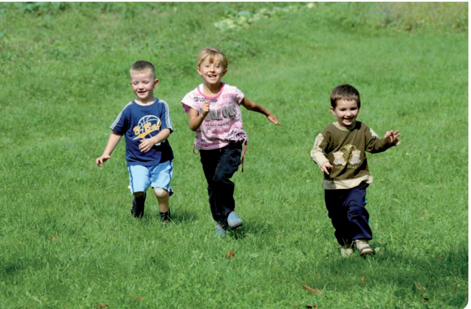
With friends again! - BiH

Handover ceremonies are generally not organised in BiH, based on the assumption that in populated areas, affected communities are well aware of survey/clearance operations and know that when these are completed, the area is safe to use. In the event that ceremonies are organised, they tend to be held in remote areas as a means of informing affected communities that the land is safe to use, or in areas where the land has significant importance for the community. Occasionally handover ceremonies are organised for donors or by companies to raise the profile of completed tasks, and provide the opportunity for interested individuals and organisations to state their appreciation and thanks to the donors.