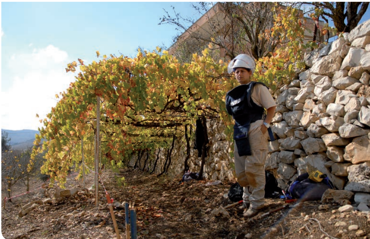
Deminer clearing vineyard in Jordan

Recommendation: Push for greater compliancy with regards to community involvement in handover procedures, and require that relevant stakeholders document and report on community involvement in a sex and age disaggregated manner.